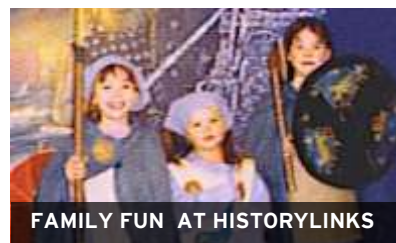
FAMILY FUN AT HISTORYLINKS

For more information and to pre-book: www.facebook.com/LairgLC or: 01549 402050 (bookings)