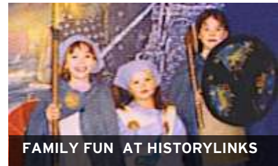
FAMILY FUN AT HISTORYLINKS

For more information: www.timespan.org.uk/programme/events/barbara-cartland-pop-up-restaurant-the-fire-of-love/