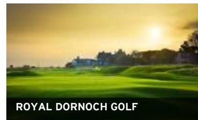
ROYAL DORNOCH GOLF