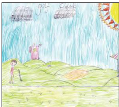
By Neve Isla McAffer – Age 7