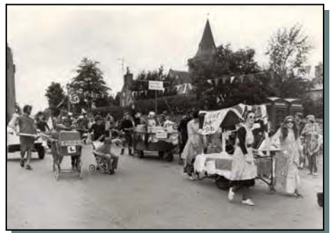
The Festival Week Fancy Dress & Parade of Floats - 1979