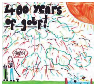
By Tilly Saunders – P7