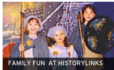
FAMILY FUN AT HISTORYLINKS

For more information: www.portmahomackcommunity.org.uk