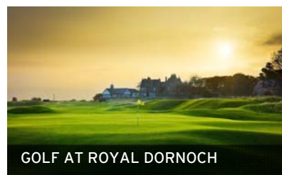
GOLF AT ROYAL DORNOCH