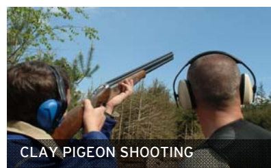
CLAY PIGEON SHOOTING