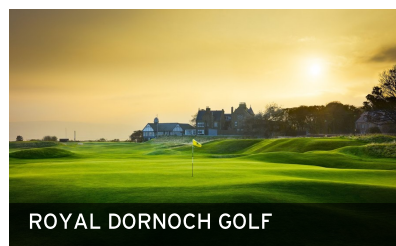
ROYAL DORNOCH GOLF